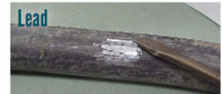
You have a lead pipe if...